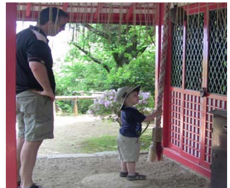
Visiting temples in Japan