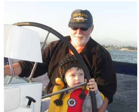
Grandpa & Cyrus sailing in the Bay